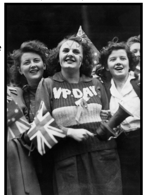
PO 2018.226

The New Guinea Campaign : The New Guinea campaign of the Pacific War lasted from January 1942 until the end of the war in August 1945. During the initial phase in early 1942, the Empire of Japan invaded the Australian-administered Mandated Territory of New Guinea (23 January) and the Australian Territory of Papua (21 July 42) and overran western New Guinea (beginning 29/30 March), which was a part of the Netherlands East Indies. During the second phase, lasting from late 1942 until the Japanese surrender, the Allies, consisting primarily of Australian and US forces, cleared the Japanese first from Papua, then the Mandate and finally from the Dutch colony.