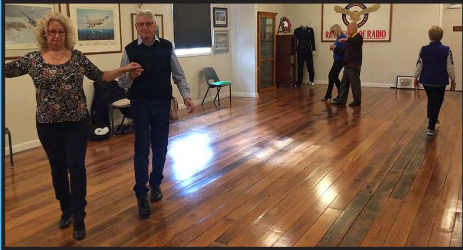
Left : With some great dance music playing, some members moved to the music area to dance.