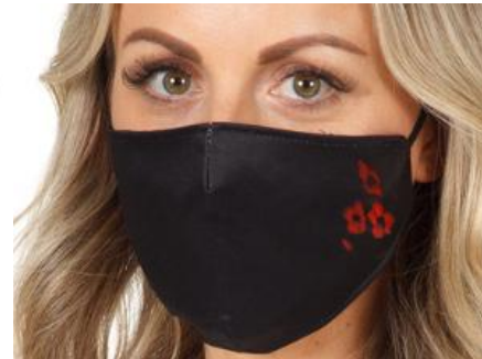
RED POPPIES ON BLACK MASK

There are various designs of face masks available from the Air Force Shop. But while the prices are very reasonable, to add the $20 postage makes it a bit expensive. However, to spread the postage costs we have purchased some of the above designs and they will be available for members to purchase for just $10 each on a ‘first-in-first-served’ basis at our upcoming November Social Luncheon Meeting on Melbourne Cup Day 2nd November.