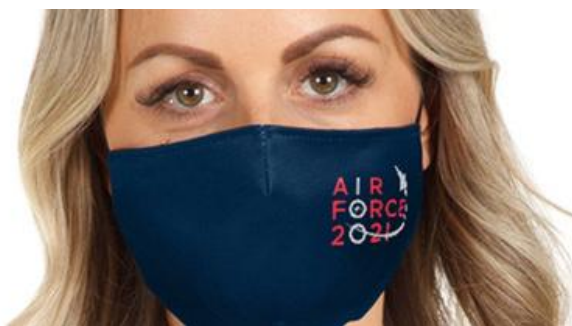
AIR FORCE 100 LOGO ON BLACK MASK