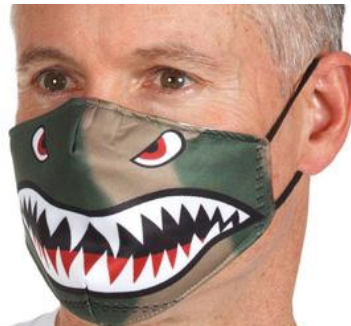
FAMILIAR WWII AIRCRAFT ‘SHARK FACE’