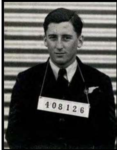
RAAF Photo showing Service Number

"I remember all the details of the first bombing of Darwin. It's been tattooed onto my brain for 70, 80 odd years.