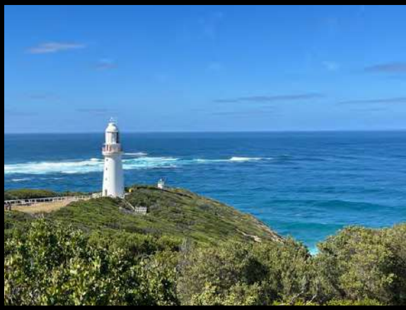
Above : View of the lighthouse from the Radar Station Doover Building