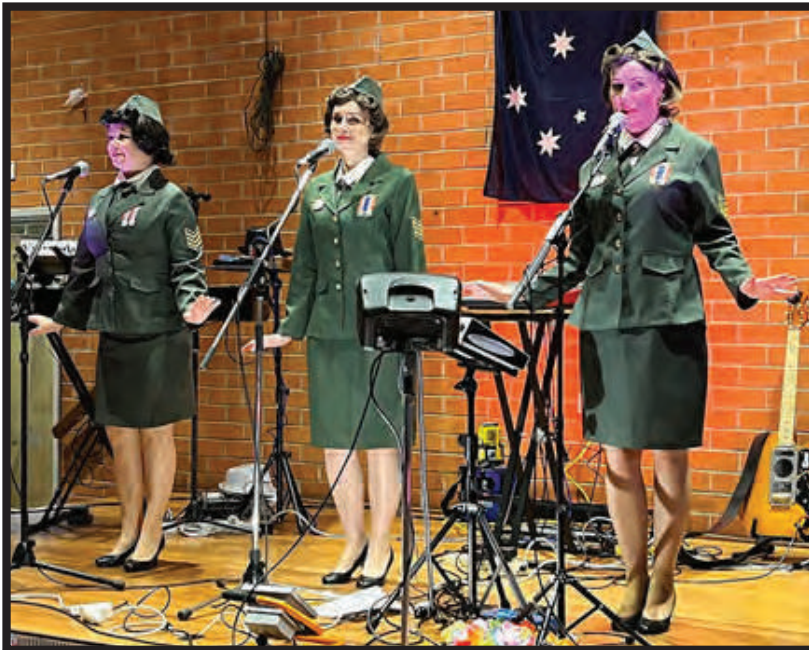
ABOVE : The Pacific Belles during their first half-hour performance before changing into Pacific theme dresses for their second half-hour performance.