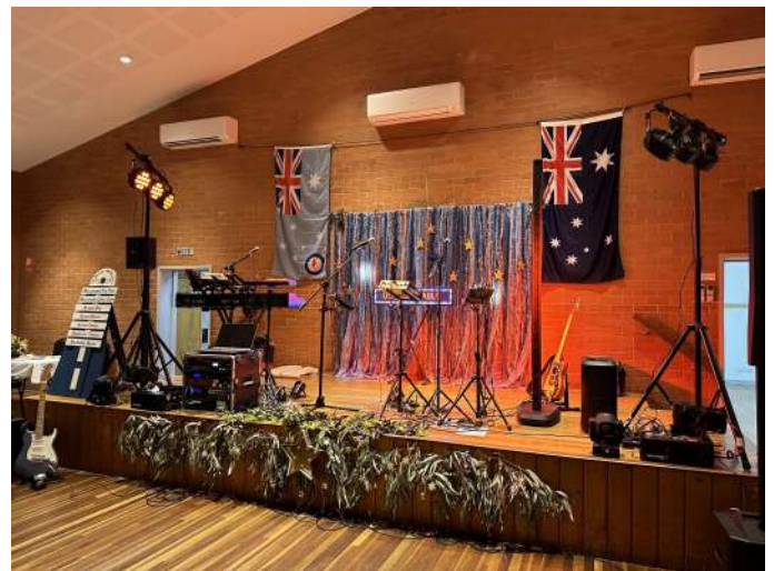
The stage is set!